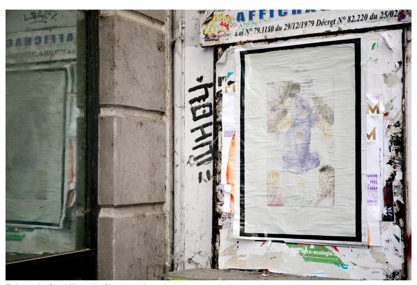
Babe on the free billboards of Lyon's 1st Arrondissement